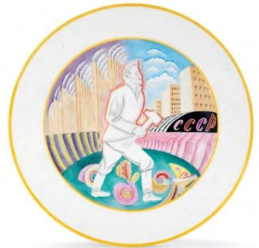
A LARGE AND RARE SOVIET PORCELAIN PROPAGANDA PLATTER By the Imperial Porcelain Factory, and the State Porcelain Factory, Petrograd, 1923 Estimate: £12,000-18,000

London – On 4 th June, Christie's Russian Art sale will offer a selection of works by numerous highly sought-after artists including Boris Grigoriev, Alexandre Iacovleff, Konstantin Somov, Nicholas Roerich, Dmitry Stelletsky and Yuri Annenkov. Session II will offer Russian Works of Art, including over forty works from the famous workshop of Fabergé, Imperial jewels, rare bronzes, Soviet Porcelain and works by the Imperial Porcelain Factory.