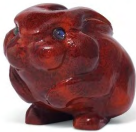
A RARE GEM-SET PURPURINE MODEL OF A RABBIT BY FABERGÉ, Circa 1900 Estimate: £50,000–70,000